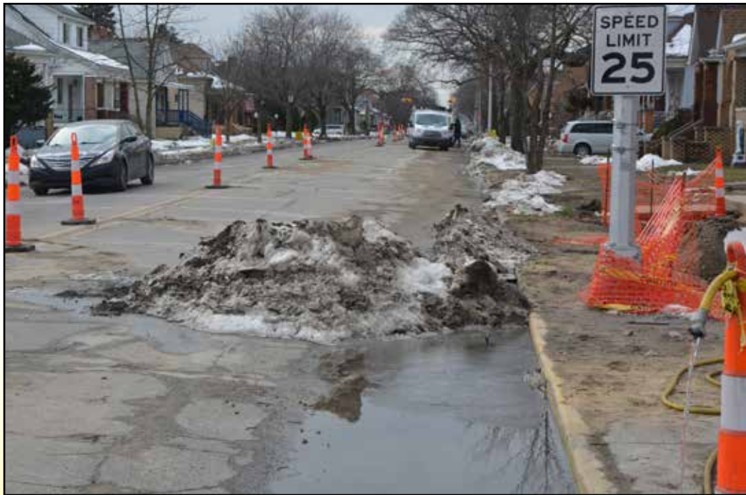
The final portion of Caniff, from Jos. Campau to Conant, will be repaved this spring and summer. Expect traffic to be tied up for a few months.

The city will also continue repaving alleys and streets, which will tie up