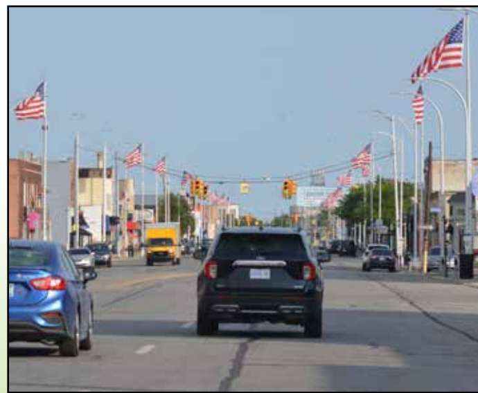
Hamtramck's Downtown Development Authority (DDA) serves the Jos. Campau business district.

“In the coming year, we plan to take concrete steps towards this restoration, including bringing on a Deputy Executive Director, rolling out a new social media campaign, and progressing towards