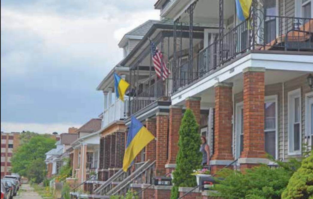
A growing number of homeowners have been complaining to city officials about their property taxes going up. In a number of incidents, however, taxes increased because additions were added to houses, which will uncapped the value of a house.

For most homeowners, property taxes can go no more than 5 percent or the rate of inflation – whichever is less. That is the state law.