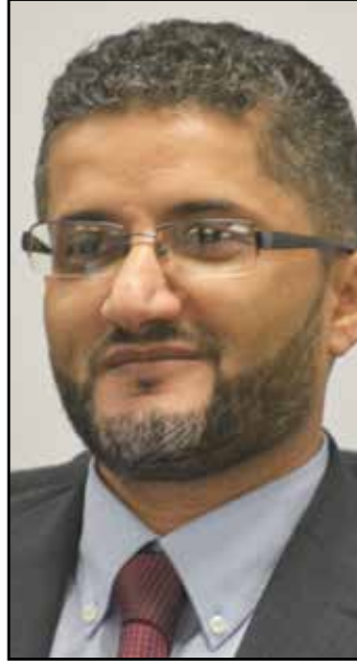
Mayor Amer Ghalib

Some 33,000 Palestinians have died since Israel's invasion, which was in retaliation of Hamas invading Israel and killing 1,200 Israelis and taking over 200 people as hostage.