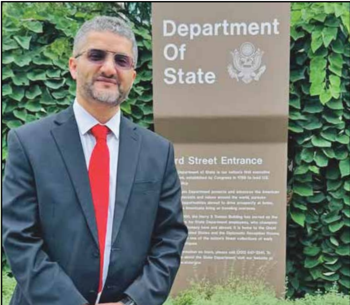
Mayor Amer Ghalib posted this photo of him posing outside the State Department building in Washington D.C. where he is preparing for a confirmation hearing in the U.S. Senate to be the next ambassador to Kuwait.