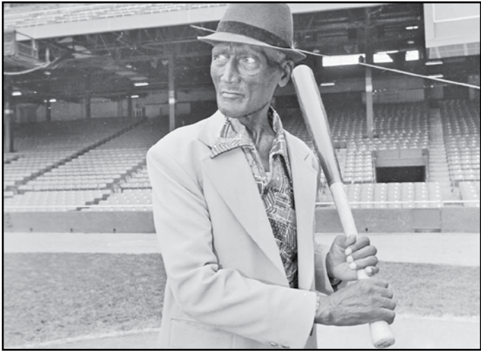
Baseball legend Norman “Turkey” Stearnes shows off his batting stance in the former Tiger Stadium.