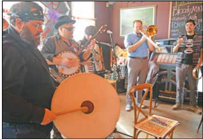
Above and below: More scenes from Paczki Day.

When it comes to good food and great times, Hamtramck has plenty to offer. In this column, we'll talk about what's happening at our bars, restaurants and at other events throughout the city.