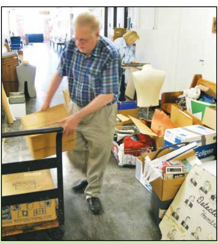
The Hamtramck Historical Museum has had another busy month with visitors. File photo

The museum held its Annual Board Retreat recently, where they dealt with a laundry list