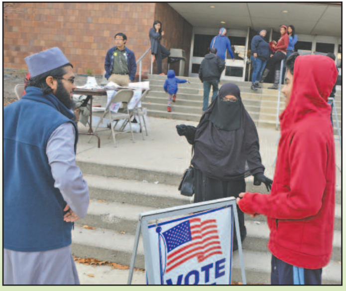
Hamtramck is not an official "sanctuary city" but there is a city ordinance prohibiting police from pro-filing and inquiring about immigration status.