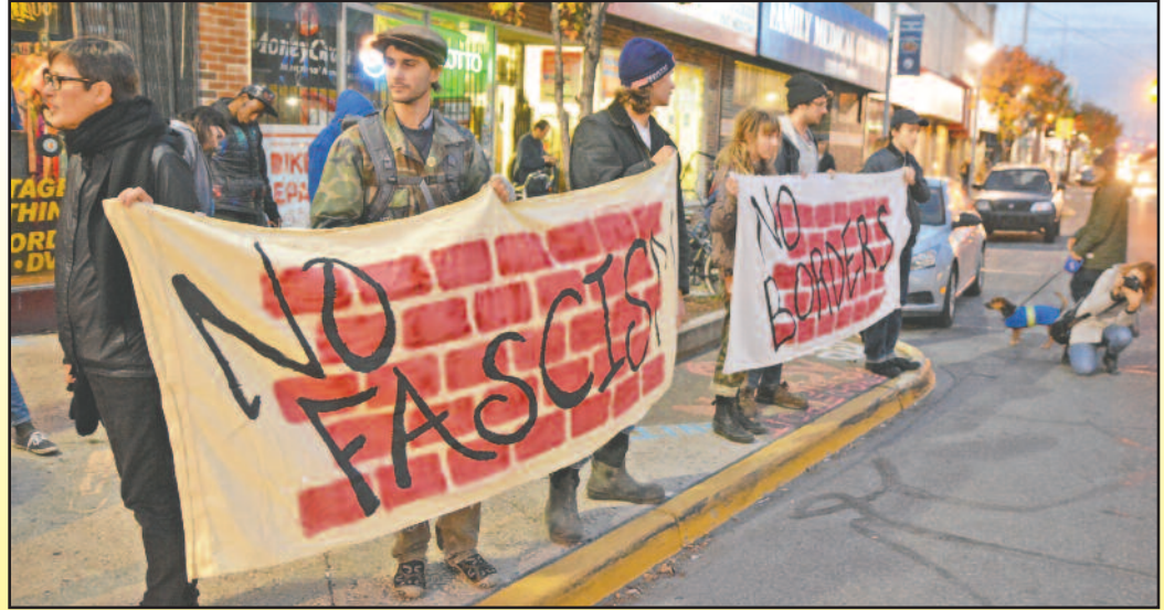
Donald Trump protestors took to the streets on Monday evening to demonstrate against the president-elect's immigration statements. About 50 folks showed up and walked from Trowbridge and Jos. Campau to the public library where a town hall meeting was taking place.