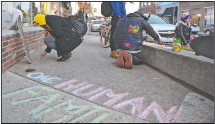
Scenes from last Monday’s protest march in Hamtramck against the immigration policy of President-Elect Donald Trump.