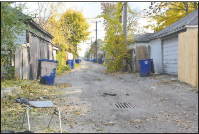
Starting next year, the city will begin repairing alleys. It's estimated that it will take $12 million to repair all of them. Those repairs will take years to complete.