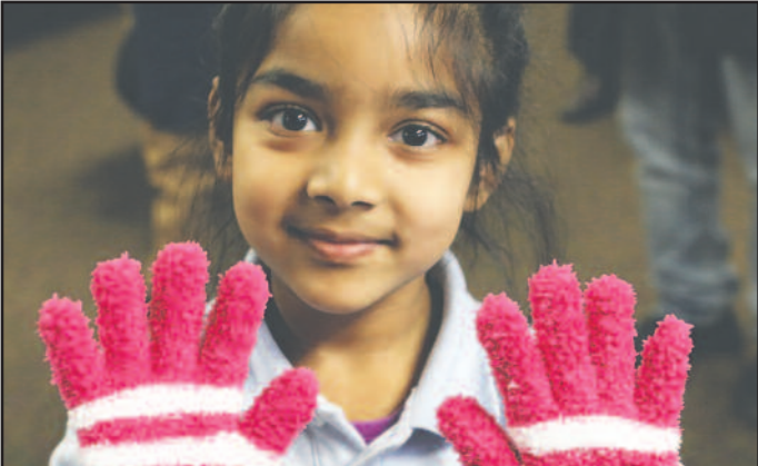
All public school district students recently received free mittens and other winter clothing thanks to a generous donation.