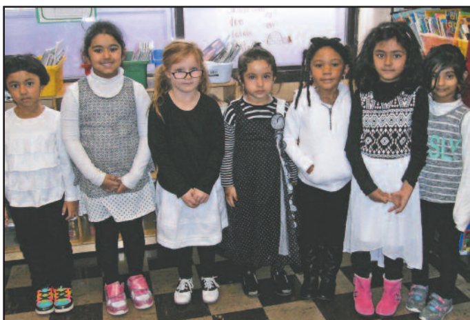
Above and below: Early Childhood Elementary School students dressed in black and white clothing to coincide with a day-long study about penguins.

Students dressed in black and white or in tacky, mismatched clothes as they read together the story of "Tacky." Classes learned how it is good to be unique and different and to share your talents with others. Students also learned about penguins through stories, videos, mapping, writing, song and dance. Students even pa-