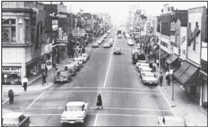
Hamtramck had its own version of “Dollar” stores many decades ago. Jos. Campau was once a major shopping magnet.