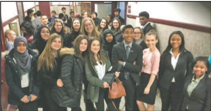
The Hamtramck High School DECA team recently performed well at a recent event.