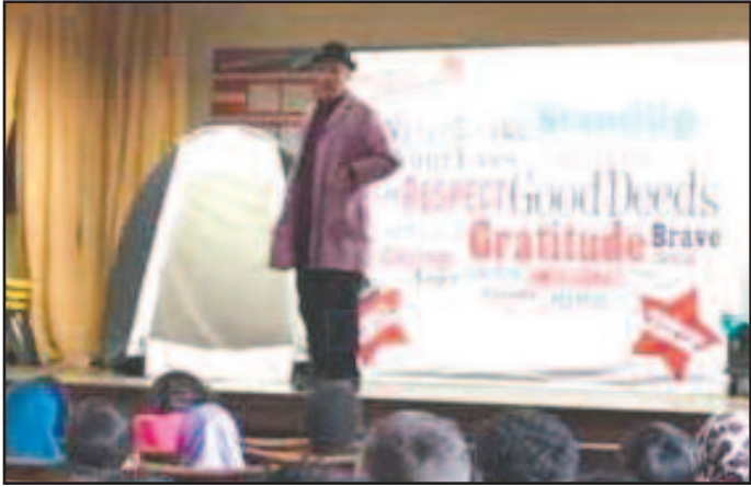
Above: Students at Dickinson West Elementary School recently participated in an assembly that focused on developing leadership skills.