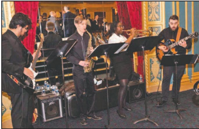
Above: Band members at Hamtramck High School recently enjoyed a special performance at a reception held at the Detroit Opera House.