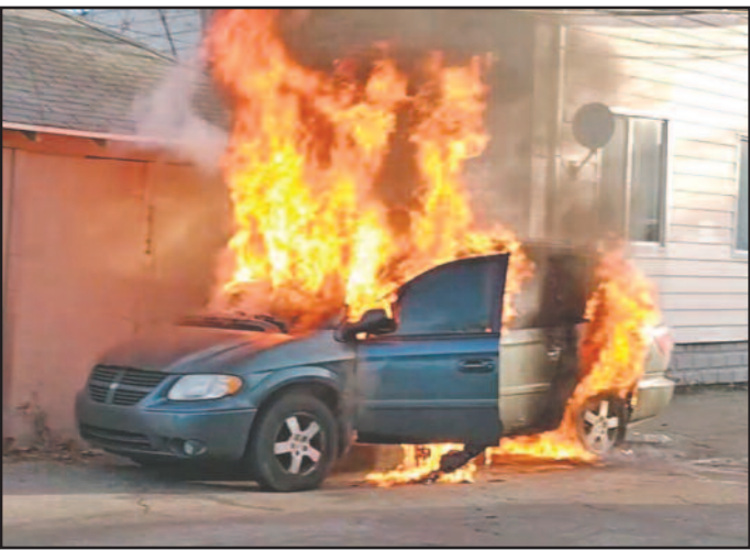
A van erupted in flames on Whalen St. last Saturday morning, which also spread to a garage.