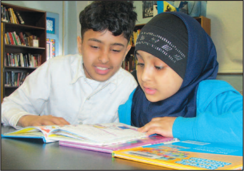
The month of March was reading month at Holbrook Elementary School.

Our guest reader was only going to read to kindergarten to 5th grade, but this time the guest reader wanted to read to the middle school kids. We had a great