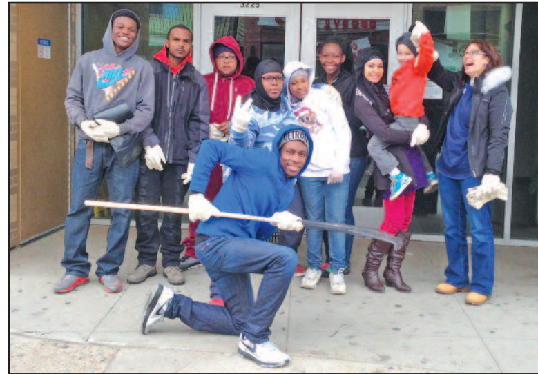
Horizon High School students get into the community spirit during the recent citywide Clean Sweep program.

evidence, Hamtramck High School was victorious and is on its way to the finals on