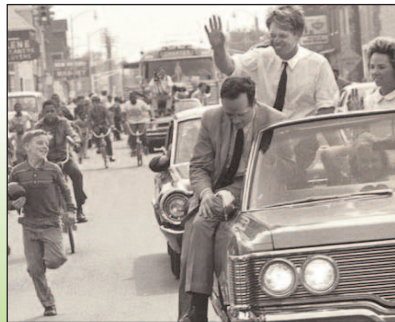
Bobby Kennedy rides down Jos. Campau on May 15, 1968.