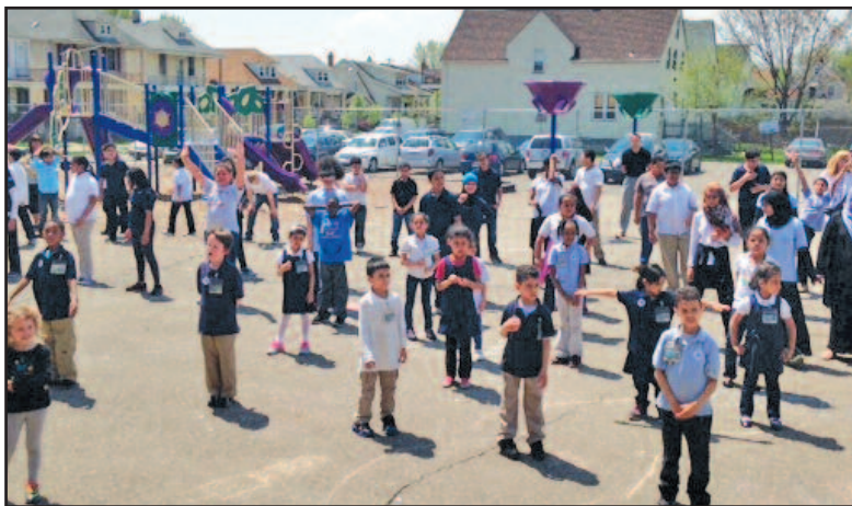
Dickinson East Elementary students learn a lesson about the importance of physical fitness.