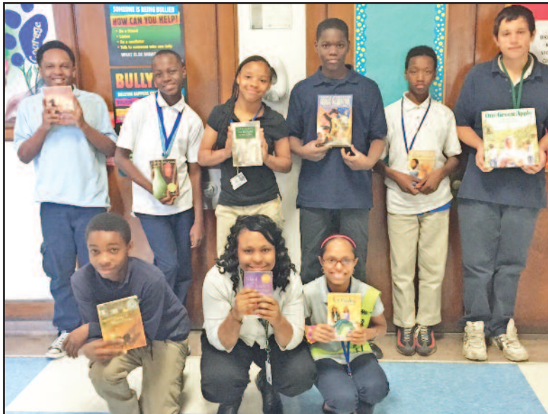
Kosciuszko Middle School recently hosted an english Language Arts program.

Here at KMS, we are committed to helping our students become life-long readers and we are excited to share that same commitment with our parents. Please make sure to join us for our next parent curriculum night this Tuesday, May 19, from 4 to 6 p.m. Our focus will be on learning how to use the data from the NWEA test that your child took to gain a better understanding of their growth over the school year and how to help them con-