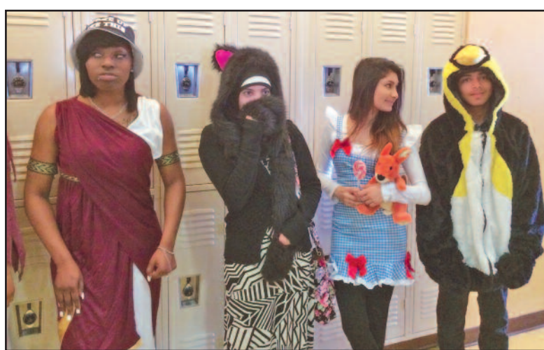
Horizon High School students performed sketches during a recent "Night of Shining Stars."