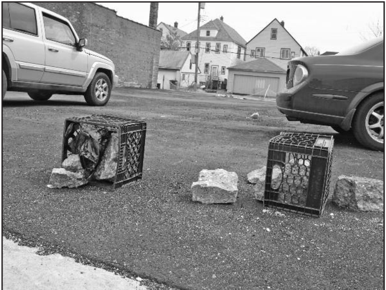
The owner of a lot on Holbrook found out the hard way about trusting a contractor to get city-required permits.