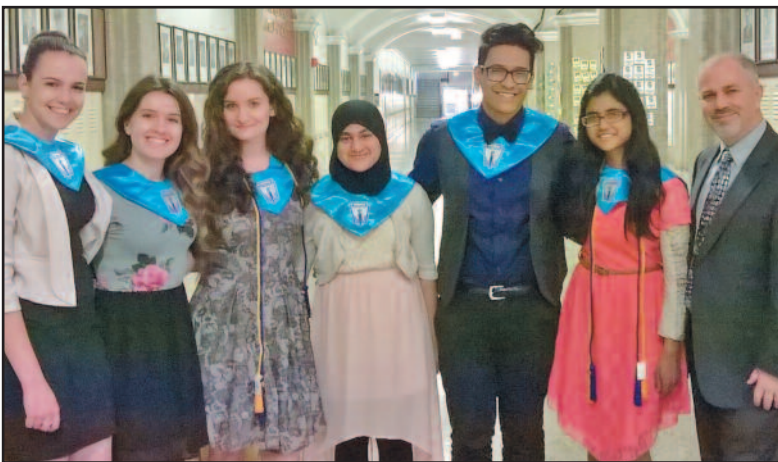
The National Honor Society at Hamtramck High School recently inducted new members.