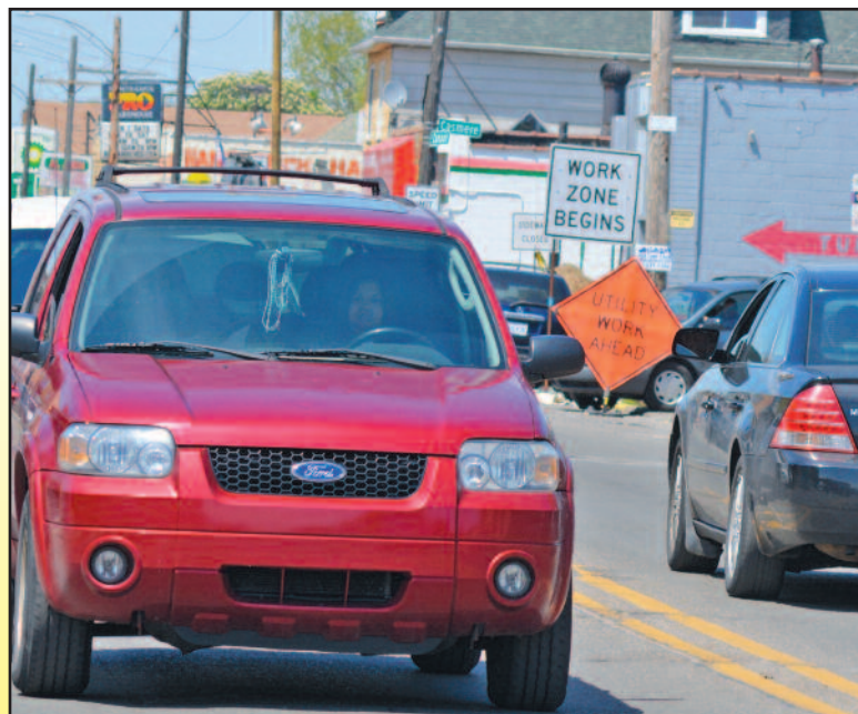
A citywide street repair program kicked off this week. But one street is noticeably not included: Conant, which is county owned. Wayne County has told city officials that repairs to Conant is way down on the list of county roads in need of repair.