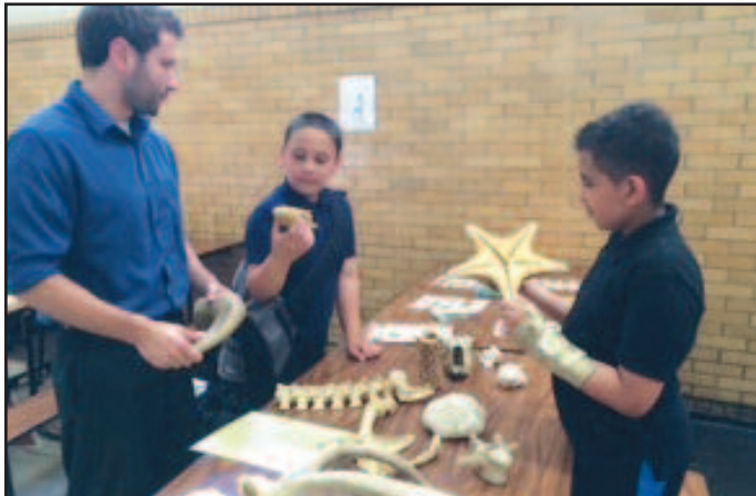
Above: Holbrook Elementary School hosted the Ann Arbor Hands-On Museum for a family science night. Below: HHS graduating seniors continued the school's tradition of a final walk-through the school.

It was especially fun to watch two fathers concentrate to get a higher grade than their sons and daughters. This evening of family is always a great event and once again we proved the Dickinson West family knows how to have a good time while learning.