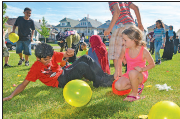
Above and below: Kosciuszko Middle School students celebrate the end of the school year with an outdoor fair.

cided to celebrate the end of the school year with an outdoor fair. Judging by the turnout on Monday, it was a huge success.