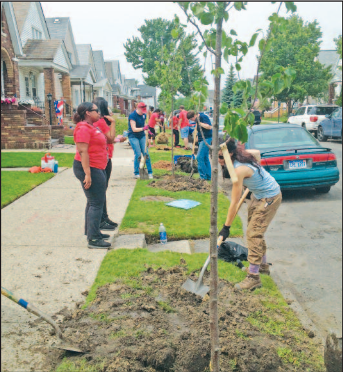
Volunteers recently planted trees in the central business area of Hamtramck. City officials say more plantings will likely continue in the fall.