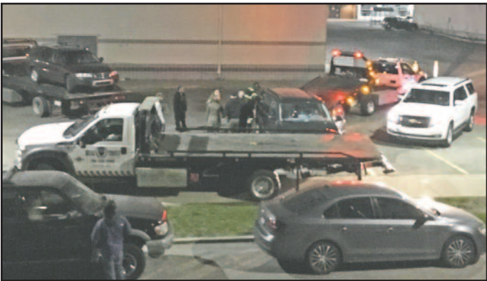
For those who were victims of a towing company that did not have authorization to tow away cars from the CVS Pharmacy parking lot, there might be a legal remedy.