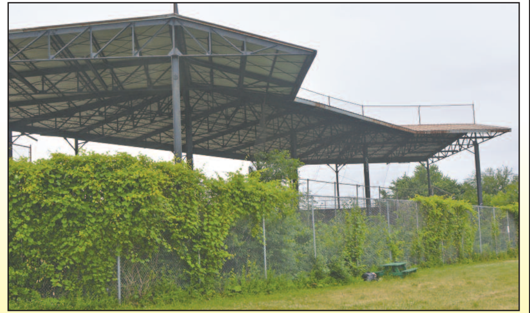
The renovation of the historic Hamtramck Stadium, located in Veterans Park, got a needed boost from Comerica Bank. Comerica recently donated $20,000 to the Friends of Historic Hamtramck Stadium.