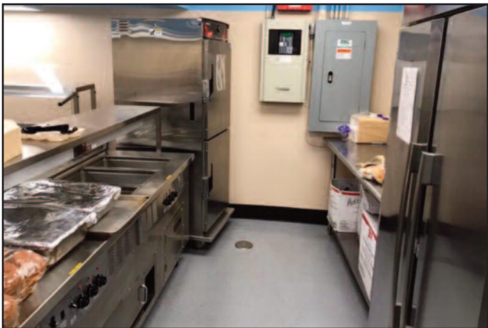
A new kitchen was installed at Dickinson East Elementary School this past summer.

been the installation of a new kitchen at Dickinson East Elementary School. That project cost $877,721. There were two sources of funding for this upgrade. Niczay said $535,408 came out of the cafeteria fund, and $352,023 came from the general fund. Other projects that need to be taken care of include: • Window replacements • Masonry repairs • Improved lights at exits • Fire alarm upgrades • Wall repairs • Classroom doors • Guardrails