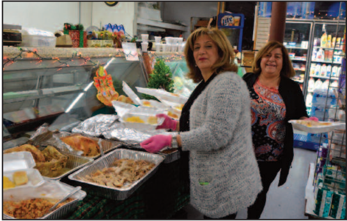
Customers at Sam's Market on Commor were treated to a free Thanksgiving meal on Wednesday.