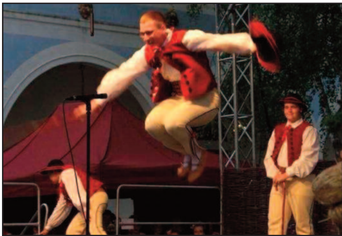
Scenes from PRCUA Gwiazda Dancers' visit to Poland last summer.