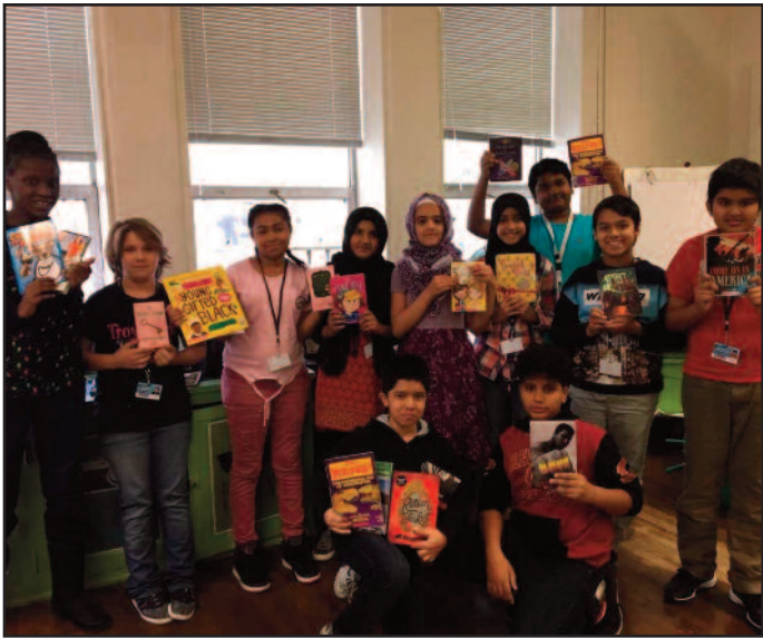
Above: Dickinson East sixth-graders show off books they received thanks to gifts from friends and family members. Below: Hamtramck Teachers' Sorority Alpha Delta Kappa (ADK) Beta Nu pose for a group photo.

Attendees raised over $5,000 in scholarship money to be used for the students of the Hamtramck Public Schools. All HPS schools benefit