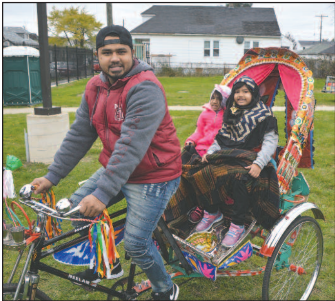
Scenes from the recent unveiling of a mural celebrating the Bangladeshi community.