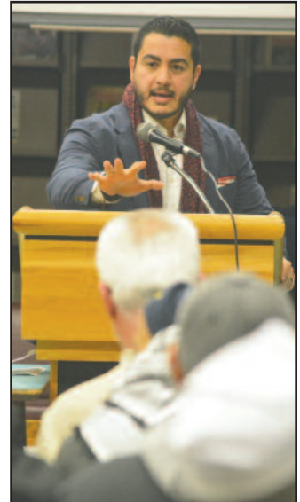
Former Democratic candidate for governor Abdul El-Sayed spoke in favor of allowing medical marijuana dispensaries at a packed meeting in the library Tuesday evening.

By Charles Sercombe The chances of Hamtramck allowing medical marijuana dispensaries looks pretty iffy at this point. According to sources, a majority of city councilmembers may back off from adopting a set of ordinances that would regulate dispensaries and grow facilities.