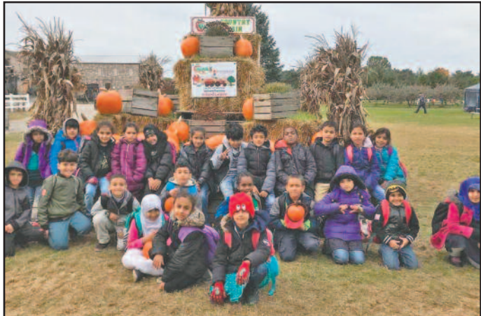
Above: Holbrook students recently visited Wiards Orchard where they enjoyed a wagon ride. Below: Kosciuszko honor students pose for a photo.

On Wednesday, the sixth graders were invited to sing at the WIDA Annual Conference. The students performed in front of