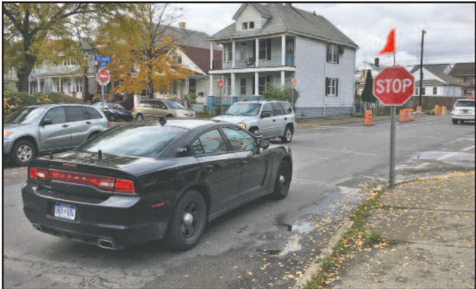
The city recently installed a stop sign at Belmont and Gallagher after a long history of car accidents at the intersection.

from Hamtramck High and Dickinson East Elementary schools cross the intersection every day during the school year.