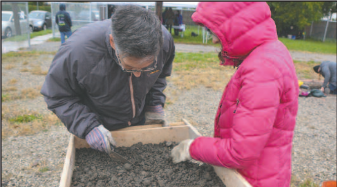
Wayne State University students are excavating the site of the city’s former municipal building, located at Jos. Campau and Alice.