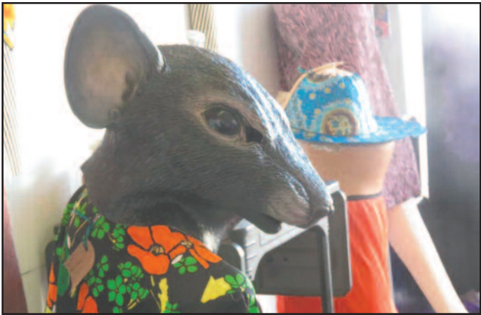
One of Hamtramck's newest shops, Rat Queen Vintage and 3-Ring Traveling Apothecary, is two businesses in one location. The vintage side of the story offers unique items for sale, and on the apothecary side there is a wide variety of scents, essential oils, perfumes and much, much more.

Komajda-Smith added that “there's so much going on right now in Hamtramck. You can virtually get almost any kind of food you want here. It's amazing, in just two square miles. It's incredible, and of course, there's other vintage shops,