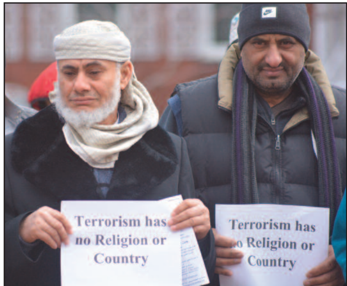
Scenes from a recent vigil held for the victims of a terrorist shooting at two New Zealand mosques.