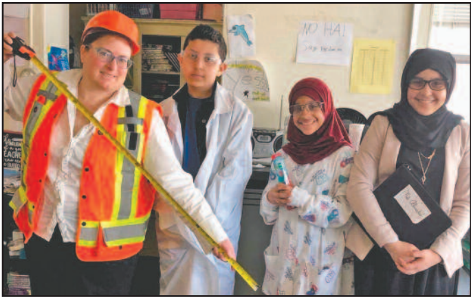
Above: It was career day at Dickinson East Elementary School. Below: the winners of a recent oratorical competition. Bottom: Dickinson students had a blast painting.