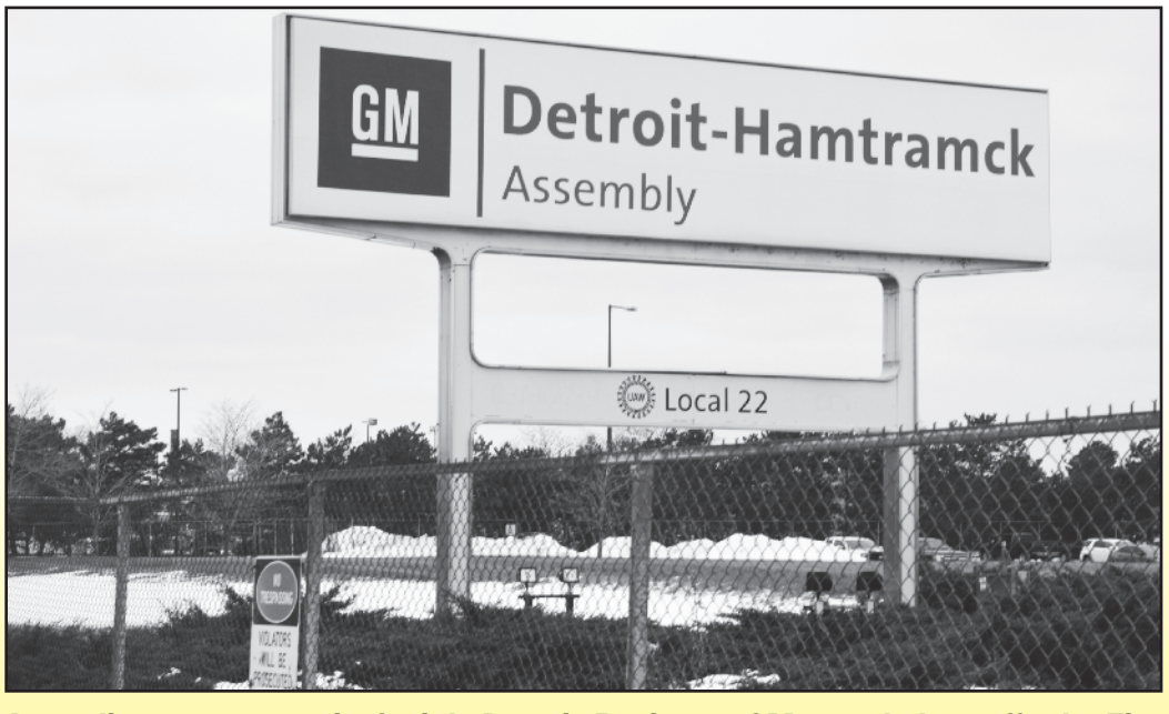
According to a report in Crain's Detroit Business, GM scuttled an offer by Fiat Chrysler to purchase the Poletown Plant.

By Charles Sercombe GM didn't have to close down its Poletown Plant. According to Crain's Detroit Business publication, officials from Fiat Chrysler approached GM to purchase the plant. The time frame when these discussions took place is unclear, but according to the report, GM rebuffed the offer. GM also changed its plan to idle the plant this June by extending the production schedule to next January. And because of that delay, Fiat Chrysler is now building a plant on Detroit's east side, on Mack Ave. For Hamtramck, it's a lost opportunity to have revenue continue coming into the city – although that amount could have