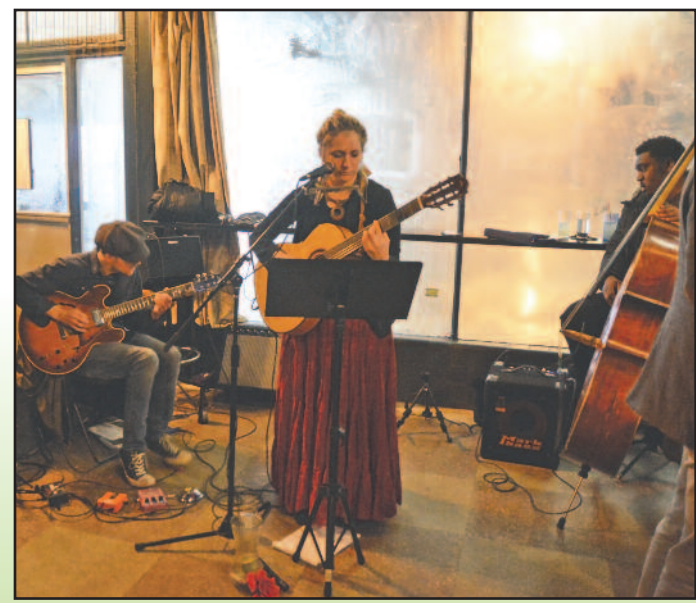
Hamtramck's newest club is Barter on Jos. Campau. The bar specializes in modestly-priced cocktails and has a big city vibe about it.

gone up or down, depending on what kind of bargain Fiat Chrysler would demand. Hamtramck has been receiving about $850,000 per year from plant in lieu of property taxes. That revenue stream is almost certain to dry up when the plant shuts down. That loss of money will be a huge blow to the city's yearly budget. The expected loss has city officials grappling with how to make ends meet. Continued on page 4