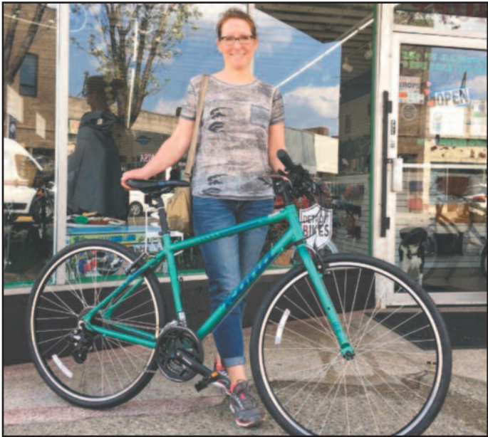
Detroit Wheelhouse on Jos. Campau will be hosting several bicycle tours this summer.

And they are newly partnered up with the Fort Wayne Coalition in