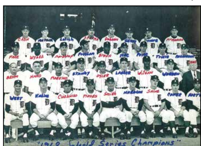
The historic 1968 Detroit Tigers pose for a team photo. Notice any unusual hand gestures in the back row?