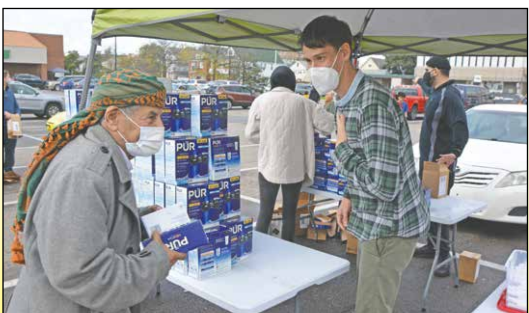
Thousands of residents lined up to receive a free water faucet filter, but there were only 700 to distribute. The city will offer more filters next Tuesday when a new supply arrives.

By Charles Sercombe Add Hamtramck to the growing list of Michigan cities with a high lead content in the drinking water. On Wednesday, the city administration issued a press release saying that a recent test of a sample of 42 houses showed six of them having slightly more lead particles in the water. According to lab results, those sample houses had 17 parts per billion, just over 15 parts per billion which triggers an alert. However, the city said there is no need to panic. Residents should first allow water from their taps to run for a little bit before consuming or using for cooking. For those households that do not have lead ser-