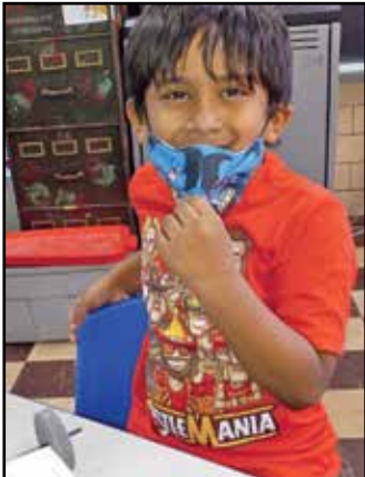
Above and below: Scenes from the ECE summer S.T.E.A.M program that focuses on core academic subjects in a fun and creative way.