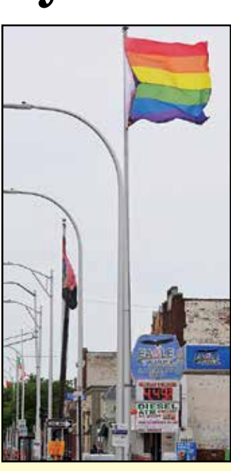
The flying of a pride flag on a Jos. Campau flagpole has brought back a familiar debate on whether the city should display such a flag.

Mayor Ameer Ghalib, the city's first Yemeni-American to hold this office, ordered the flag to be removed. The Review reached out to the mayor for comment, and he gave a lengthy response: