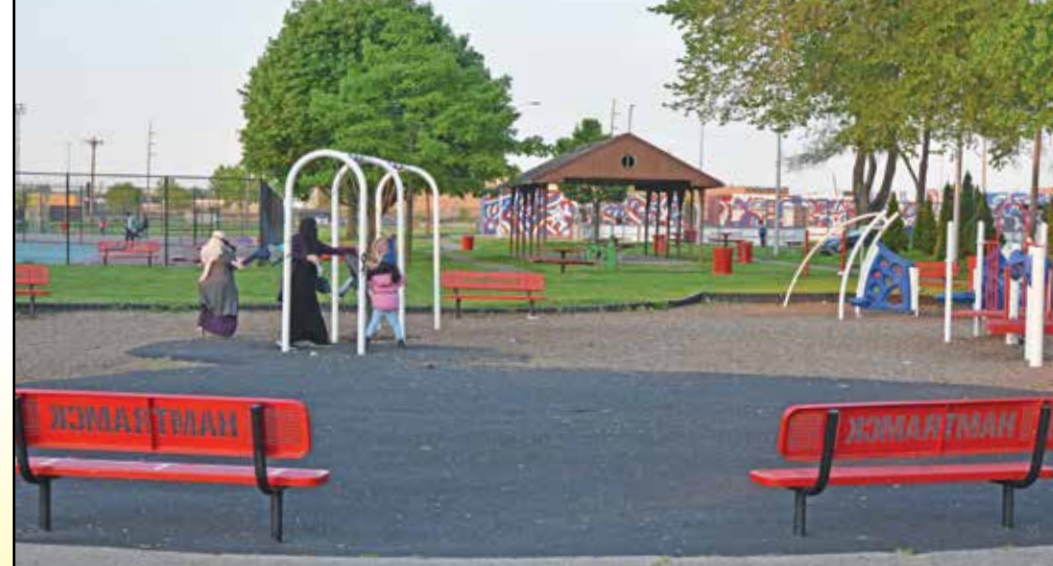
Expect to see additional improvements at Veterans Park in the coming months. One important addition will be restrooms - something that's been missing for decades. Also coming this summer is a playscape.

high schoolers, amateur teams and other organizations.