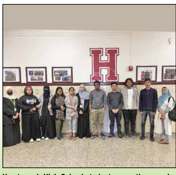
Hamtramck High School students recently earned a Michigan Seal of Biliteracy. The students are proficient in English and one other world language.